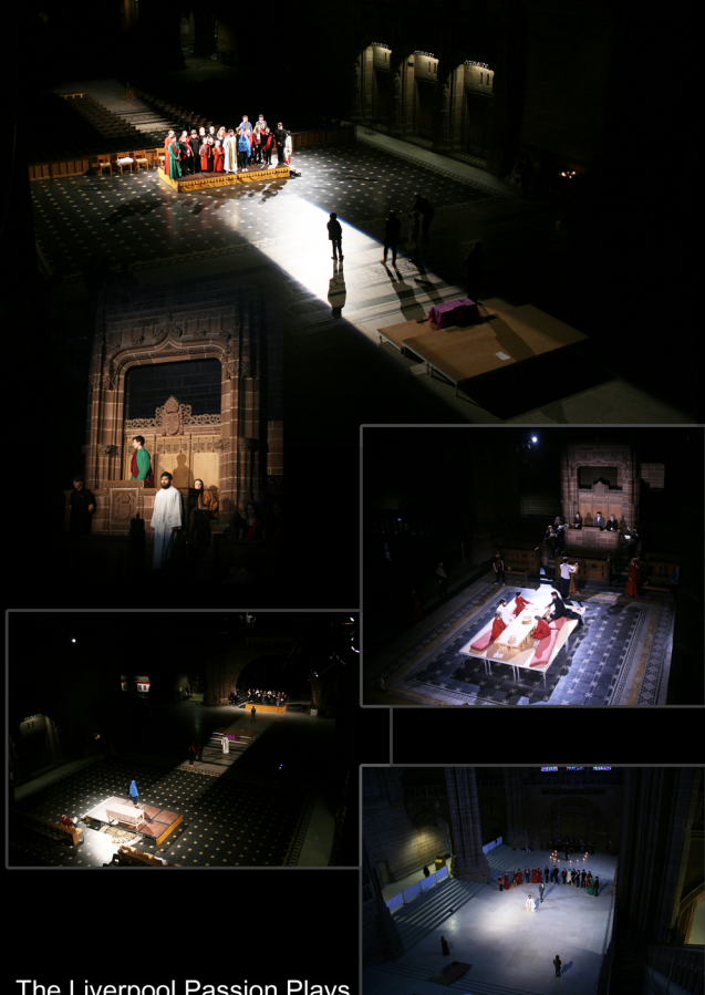
The Liverpool Passion Plays For The Liverpool Anglican Cathedral